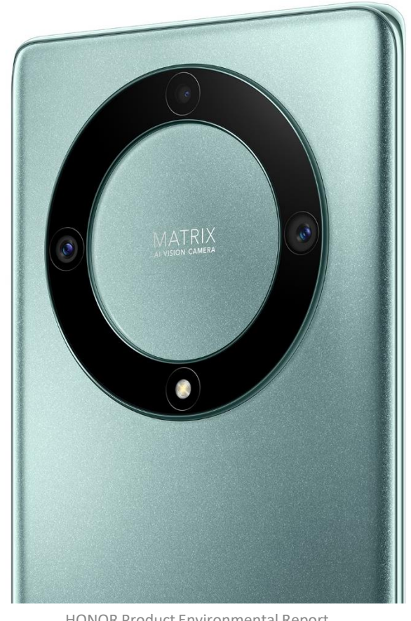
HONOR Product Environmental Report

In addition, the device including the optional charger meets energy efficiency requirements of EU ErP Directive 2019/1782 and Commission Regulation (EC) No. 1275/2008 and (EU) 801/2013.