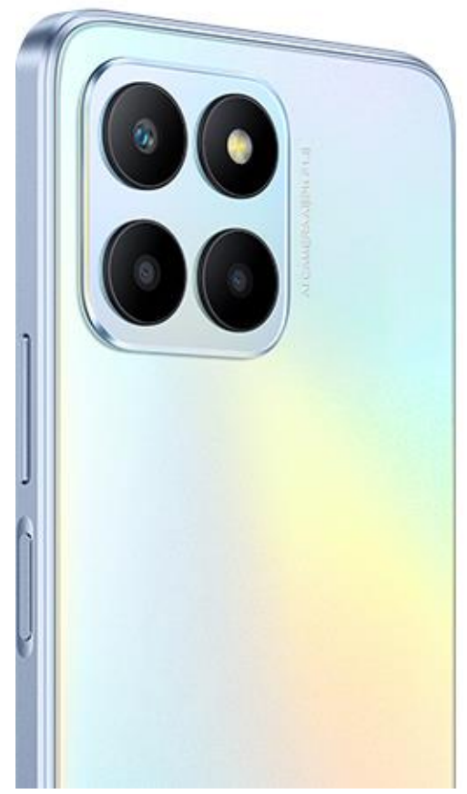
HONOR Product Environmental Report

In addition, the device including the optional charger meets energy efficiency requirements of EU ErP Directive (EU) 2019/1782 and Commission Regulation (EC) No. 1275/2008 and (EU) 801/2013.