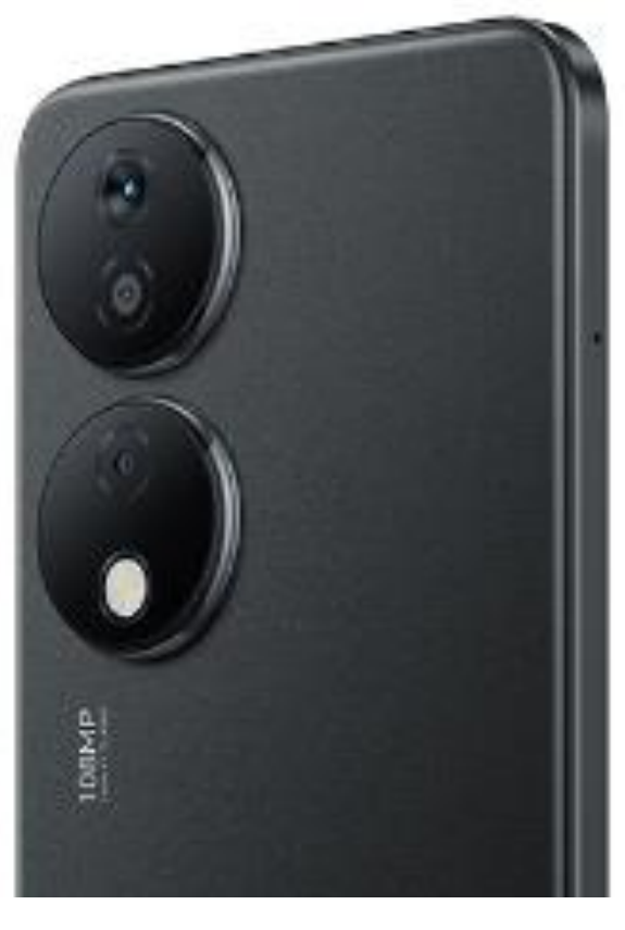
HONOR Product Environmental Report

In addition, the device including the recommended charger meets energy efficiency requirements of EU ErP Directive (EU) 2019/1782 and Commission Regulation (EC) No. 1275/2008 and (EU) 801/2013.