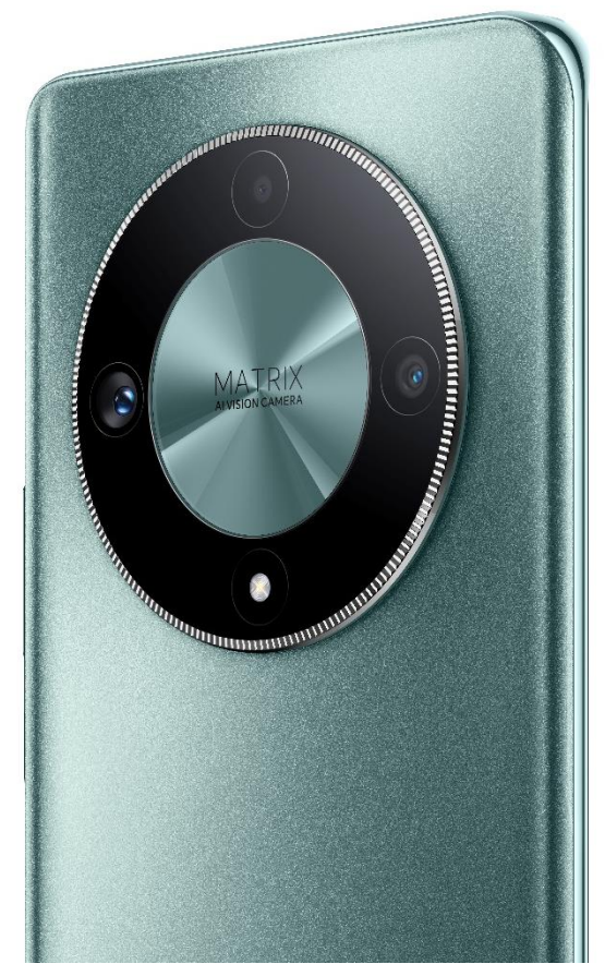
HONOR Product Environmental Report

In addition, the device including the optional charger meets energy efficiency requirements of EU ErP Directive (EU) 2019/1782 and Commission Regulation (EC) No. 1275/2008 and (EU) 801/2013.