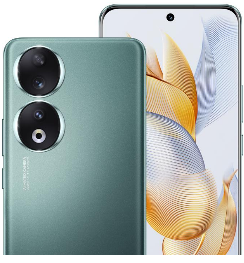
HONOR Product Environmental Report

In addition, the device including the charger meets energy efficiency requirements of EU ErP Directive (EU) 2019/1782 and Commission Regulation (EC) No. 1275/2008 and (EU) 801/2013.